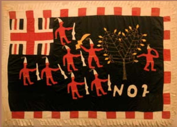
Asafo Flag, No. 2 Company; created by Akwa Osei; Ghana, Fante people; c. 1900; Cotton and rayon, embroidery and appliqué

Educators can enter the Academy for free during regular museum hours by showing their school ID cards.