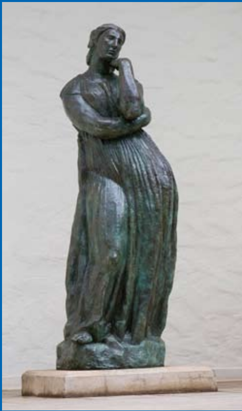
La Grande Penelope , 1912, bronze, by Emile Bourdelle

Looking for new ways to teach your students about the world around them? Look no further than the Honolulu Academy of Arts. You can use the museum's collection to teach a variety of lessons in many subjects. To get an idea of what can be learned at the Academy, we invite you to discover the story behind this important work of art.